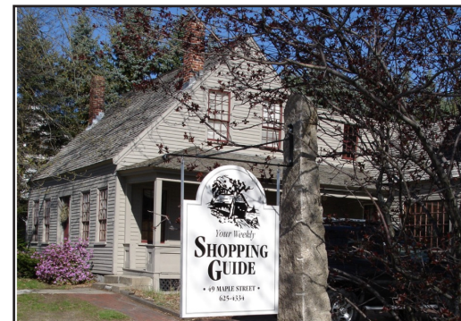
Current location in Cornish