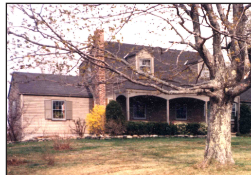
Second Cornish location, 1968