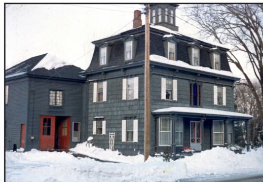
First Cornish location, 1960