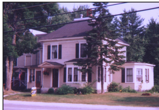
Original Location in Kezar Falls